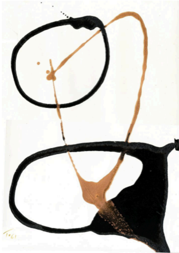
Calligramme XXA (perspective), 1961