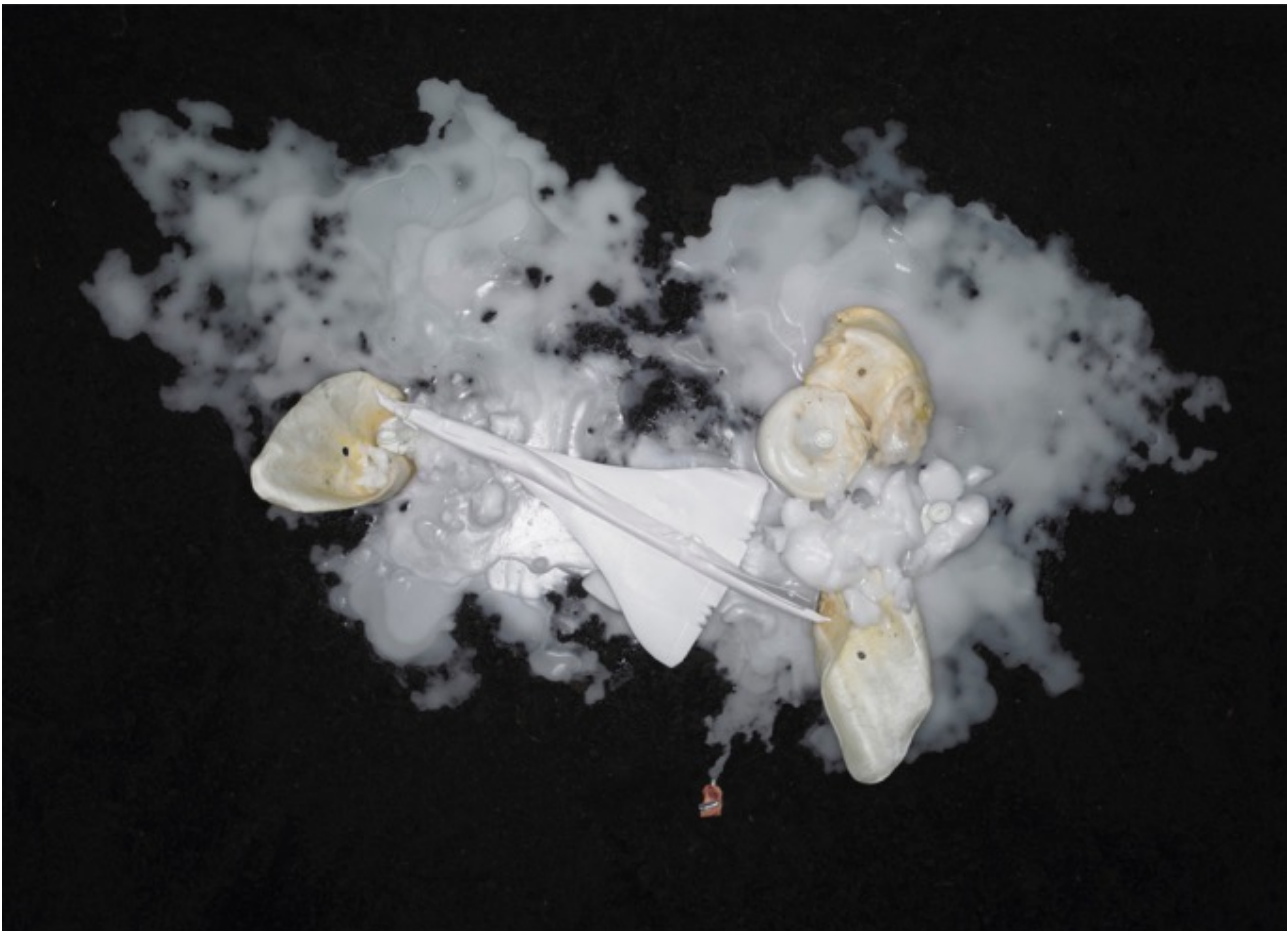
Filip Berendt, from the series Still Life

The series Pandemic revolves around the close encounter with elements such as mould and fungal colonies, which are captured in their nature of live substance, enriched by an array of details. Although they appear as though objective, these images are not characterised by the detachment of a scientific documentation: on the contrary, as the title itself suggests, they hold within them a hidden energy, universal and potentially dangerous. The inevitable encounter with something we're used to thinking of in terms of the semantic field of the "small" and "superficial", disturbs us and at the same time seduces us. As a direct consequence, in the attempt to control these feelings we're driven to place what we see into a familiar domain, by instinctively finding references to abstract iconography or to objects characterised by recognisable forms and functions. The effectiveness of the project, which insists on the gap between habit and perception, is guaranteed by the "excess of form", defined as such by Bataille himself. It's not so much the subject that creates discomfort in the viewer, but the importance the photographer gives to it, from the point of view of composition and dimension.